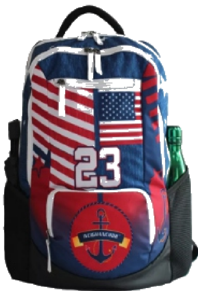
Dimensions: 21" H x 13" W x 9" D