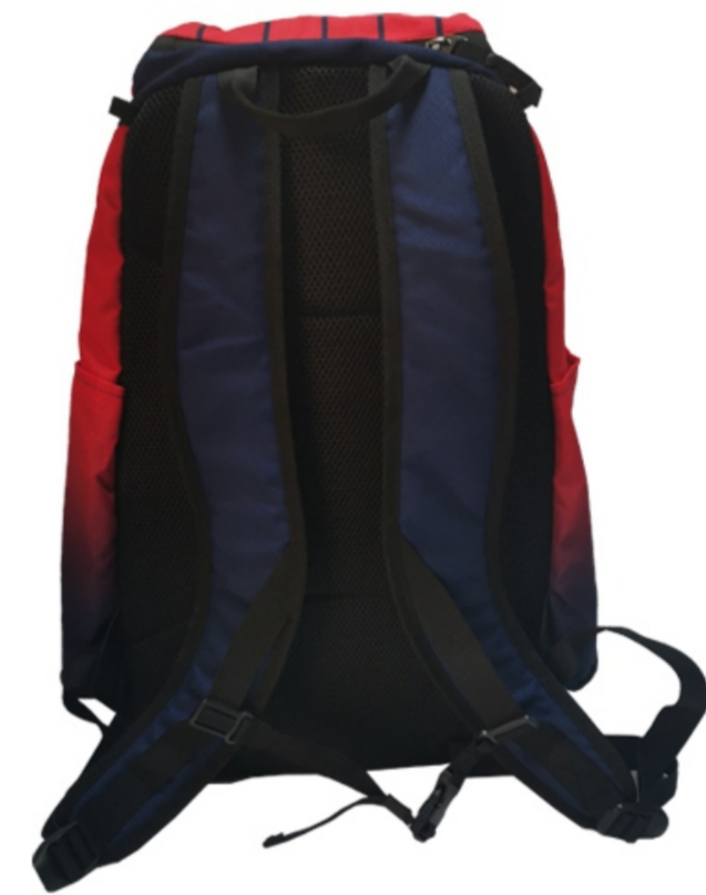
Dimensions: 21" H x 13" W x 9" D