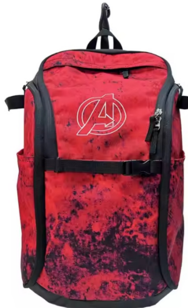
Dimensions: 18" x 13" x 8"