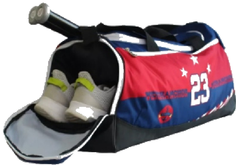
Dimensions: 23" L x 12" W x 13" H