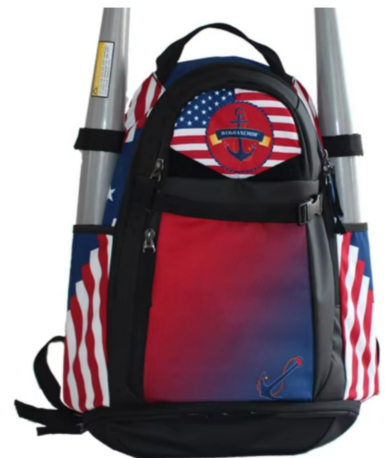
Dimensions: 16" H x 12" W x 6" D