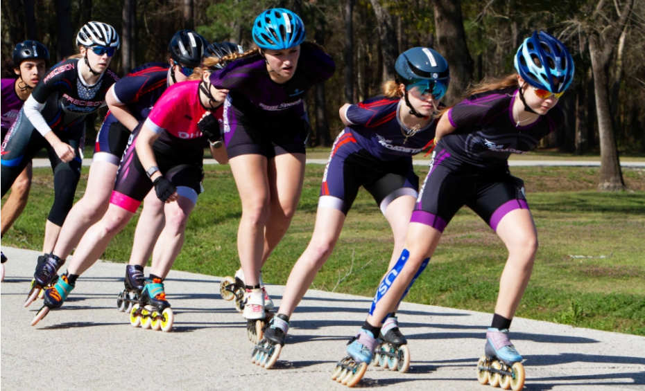
01 / Speed skating suit